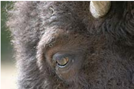
Click to enlarge this image. (267kb)

* PDF reader available here (opens in a new window).