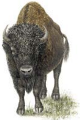
Wood bison (western Canada) - taller, darker, larger hump than plains' bison Click to enlarge this image. (85kb)